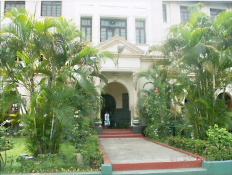
Entrance to Main Building