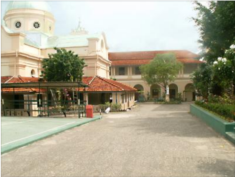
Chapel and Parlour