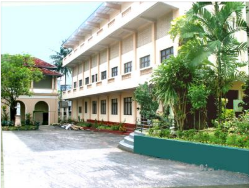
Beside the Grotto