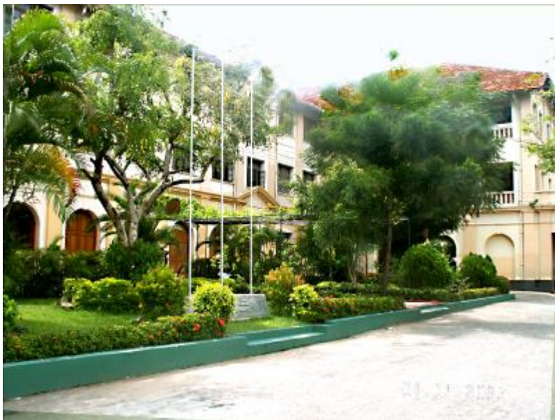
Hall Upper and Lower School